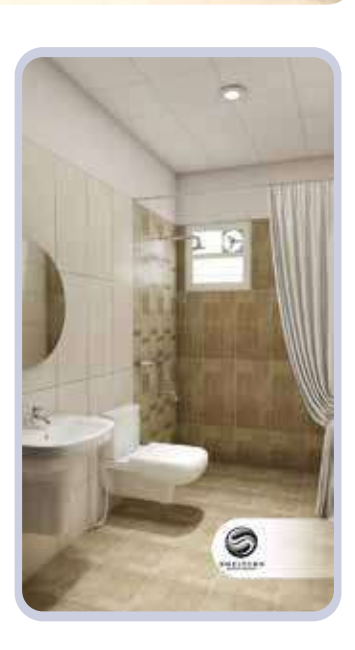
*Add-on interior design and furnishing based on the requirement for an extra cost.